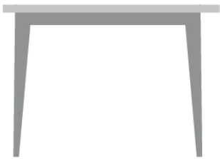
IMAGE AVAILABLE SOON

Designed to provide maximum comfort, the SKIN collection has a wide variety of frames and upholstery to better adapt the design to the setting. Our range of chairs, benches and stools enables this design to fit into any setting in your office. Spider chair for indoor use. Fibreglass and PP injected casing. Chrome-plated or white-painted steel structure. Foamed vinyl fabric with polyester-cotton textile frame. Suitable for indoor furniture with good resistance to wear and tear, waterproof, durable and easy to clean. Hand washing with neutral detergent is recommended. Strong and durable colours. 5 mm thick foams that withstand a pressure of 18 kg. To avoid marks, please do not stack upholstered chairs.