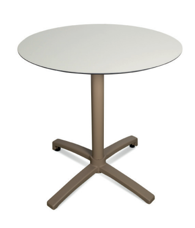
Table in painted aluminium. Folding system. Indoor and outdoor use. HPL tabletop.