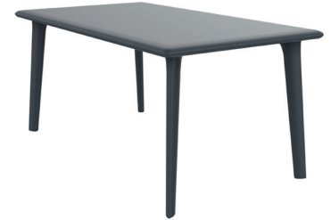
Table for indoor and outdoor use. Table top and legs injected in polypropylene. Powder coated zink steel structure in accordance to corrosion regulation UNE EN/ISO 9227:2012. UV protection. Available in 2 sizes: 90x90, net weight 11,74 kg (25,88 lb), 160x90, net weight 16,75 kg (36,93 lb).