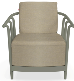
Raff Lounge Armchair Salvia Cushion Limonetto 07049