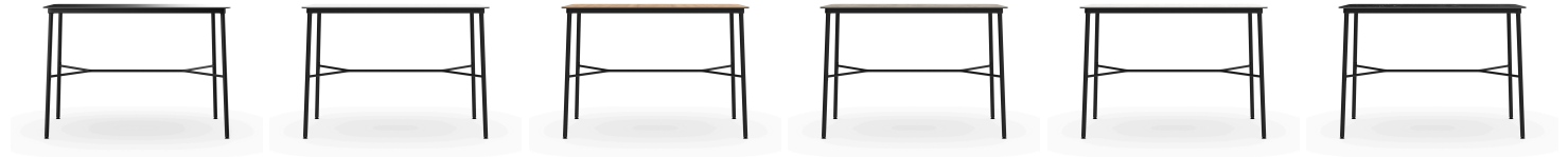
Hub Black High Table 150x70 Hpl Black 06463