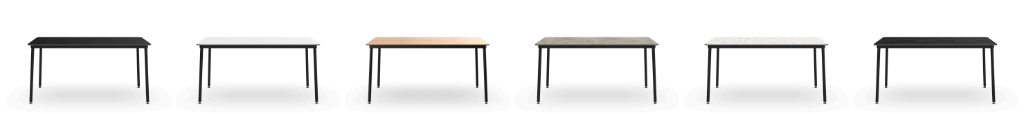
Table Hub Black 150x90 Hpl Black Hub Table 150x90 Hpl Table Hub Black 150x90 Hpl Table Black Hub 150x90 Hpl Table Hub Black 150x90 Hpl Table Hub Black 150x90 Hpl 06343 06344 06345 06346 06347 06348