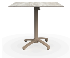
Hpl Washed Wood Table 80x80 Fall Sand Leg 05016