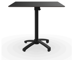
Hpl Black Table 80x80 Fall Black Leg 05020