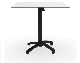
Hpl White Table 80x80 Fall Black Leg 05019