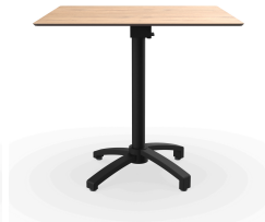
Hpl Natural Oak Table 80x80 Fall Black Leg 05024