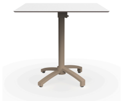
Hpl White Table 80x80 Fall Sand Leg 05013