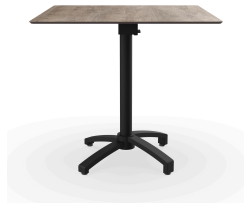
Hpl Ashen Oak Table 80x80 Fall Black Leg 05023