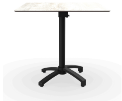
Hpl Washed Wood Table 80x80 Fall Black Leg 05022