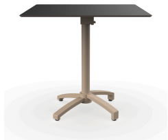
Hpl Black Table 80x80 Fall Sand Leg 05014