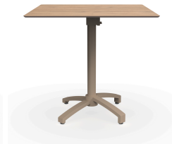
Hpl Natural Oak Table 80x80 Fall Sand Leg 05018