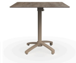
Hpl Ashen Oak Table 80x80 Fall Sand Leg 05017