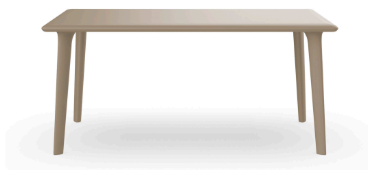
New Dessa 160x90 Table Sand 03947