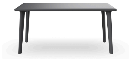
New Dessa 160x90 Table Dark Grey 03946