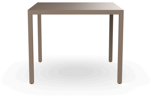
Barcino Sand Table 90x90 01400