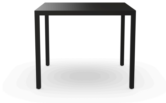
Barcino Black Table 90x90 01401