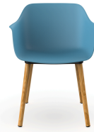
Silla Shape Wood Azul Retro 05313