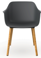
Silla Shape Wood Gris Oscuro 05312