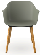
Silla Shape Wood Gris Verdoso 05310