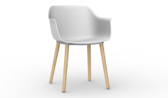
Silla Shape Wood Blanco 05309