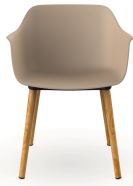
Silla Shape Wood Arena 05311