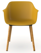
Silla Shape Wood Toscano 05314