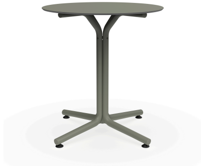
Bini Table Green Grey Hpl Green Grey Ø70 06074