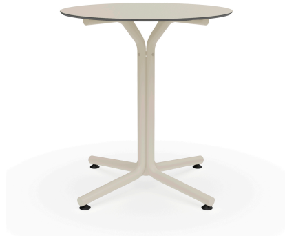
Bini Table Ivory Hpl Ivory Ø70 06075