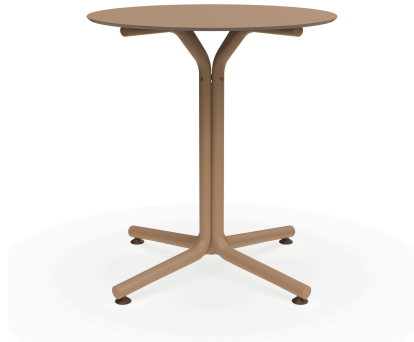
Bini Table Sand Hpl Sand Ø70 06638