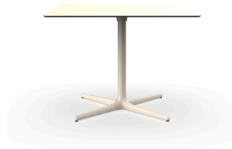
Toledo XI Table 100x100 Ivory 05880