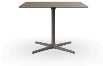
Toledo XI Table 100x100 Chocolate 05879