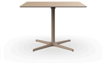
Sand Toledo Table 100x100 06608