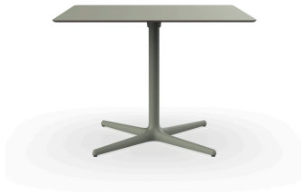
Toledo Table XI 100x100 Green Grey 05878