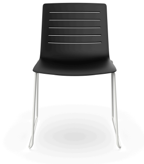
Silla Patin Skin Negra Estructura Blanca 03459