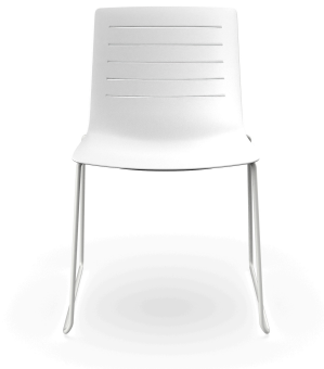
Silla Patin Skin Blanca 03458