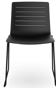
Silla Patin Skin Negra 06718