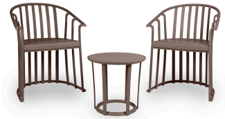
Chocolate Raff Set (2 armchairs + 1 Table) 04971