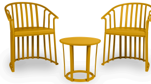
Tuscan Raff Set (2 armchairs + 1 Table) 04970