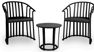
Black Raff Set (2 armchairs + 1 Table) 04967