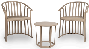
Sand Raff Set (2 armchairs + 1 Table) 04966