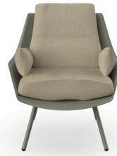
Anou Sofa Salvia Limonetto 07064