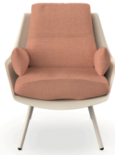
Anou Sofa Nacar Amber 07063