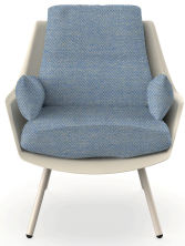
Anou Sofa Nacar Denim 07061