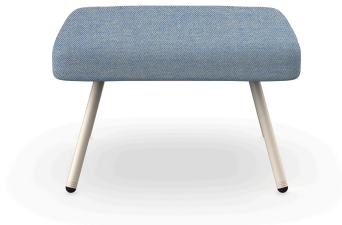
Pouf Anou Nacar Denim 07069