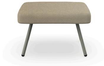
Pouf Anou Salvia Limonetto 07072