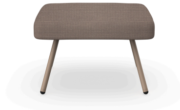
Pouf Anou Duna Mocha 07073