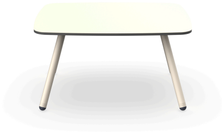
Anou Nacar Side Table 07066