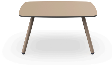
Anou Duna Side Table 07067