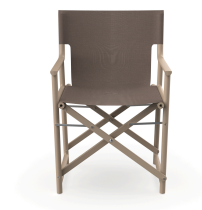
Boss Duna Chair Mocha Fabric 06825