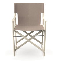
Boss Nácar Chair Mud Fabric 06827