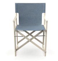
Boss Nácar Chair Denim Fabric 06828