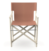
Boss Nácar Chair Amber Fabric 06826