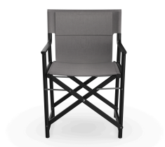
Boss Noche Chair Smoke Fabric 06823