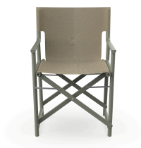
Boss Salvia Chair Limonetto Fabric 06824