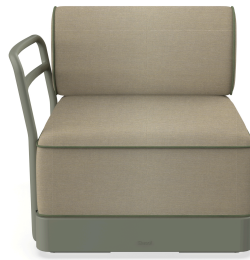
Terminal Brisa Salvia Cushion Limonetto + Fern 06882