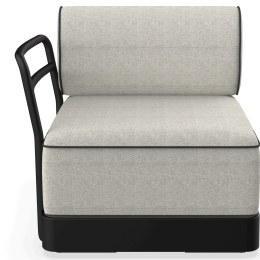
Brisa Terminal Noche Cushion Salina 05 + Dolce 55 06883