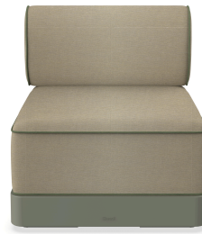
Brisa Basic Salvia Cushion Limonetto + Fern 06795