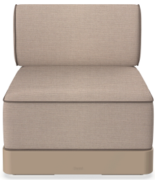
Brisa Basic Duna Cushion Mud + Mocha 06793