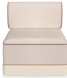
Brisa Basic Nácar Cushion Hazelnut + Amber 06794