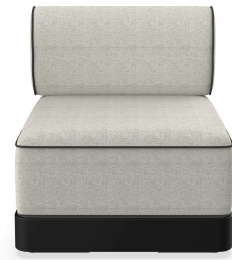
Brisa Basic Noche Salina 05 Cushion + Dolce 55 06796