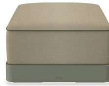
Brisa Ottoman Salvia Cushion Limonetto + Fern 06791