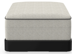
Brisa Ottoman Night Cushion Salina 05 + Dolce 55 06792