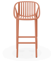
Terracotta Bini High Stool 06541