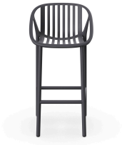
Dark Grey Bini High Stool 06538