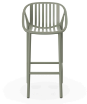
Greenish Grey Bini High Stool 06539