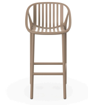
Sand Bini High Stool 06543