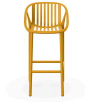
Tuscan Bini High Stool 06542