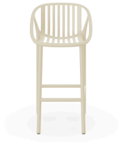
Stool Ivory Bini High Stool 06540