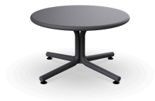
Dark GrEy Bini Lounge Table 05398