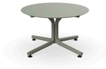
Bini Lounge Table Green Grey Hpl Green Grey Ø70 06082