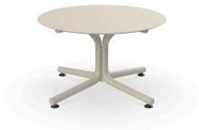
Bini Lounge Table Ivory Hpl Ivory Ø70 06083