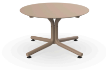
Bini Lounge Table Ivory Hpl Sand Ø70 06639