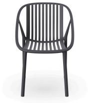
Bini Chair Dark Grey 05376