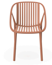
Bini Chair Terra Cotta 05379