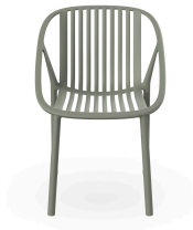
Bini Chair Green-Grey 05377