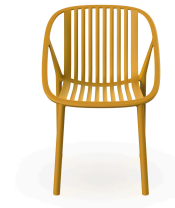
Bini Chair Tuscan 05380