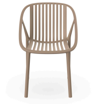
Bini Chair Sand 05381