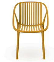
Bini Chair Tuscan 05380