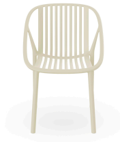
Bini Chair Ivory 05378