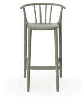
High Woody Green-Grey Barstool 05448