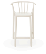
Medium Woody Ivory Barstool 05452