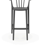
High Woody Dark Grey Barstool 05450