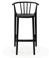
High Woody Black Barstool 05445