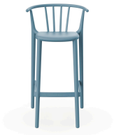
High Woody Retro Blue Barstool 05447