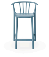
Medium Woody Retro Blue Barstool 05455