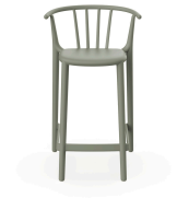
Medium Woody Green-Grey Barstool 05456