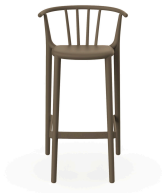
High Woody Chocolate Barstool 05446