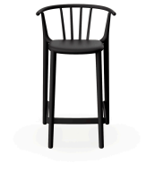
Medium Woody Black Barstool 05453