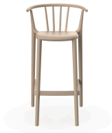
High Woody Sand Barstool 05449