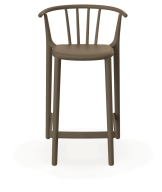
Medium Woody Chocolate Barstool 05454