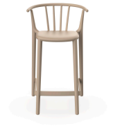
Medium Woody Sand Barstool 05457