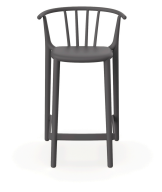
Medium Woody Dark Grey Barstool 05458