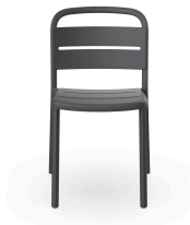
Como Chair Dark Grey 05344