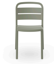
Como Chair Green-Grey 05345