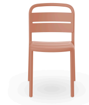
Como Chair Terra Cotta 05347