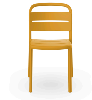
Como Chair Tuscan 05348