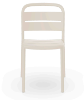
Como Chair Ivory 05343