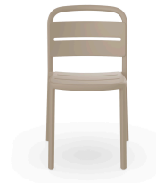
Como Chair Sand 05346