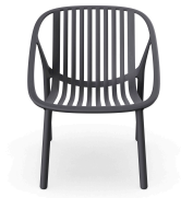
Bini Lounge Armchair Dark Grey 05382