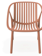
Bini Lounge Armchair Terra Cotta 05385