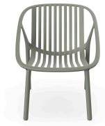
Sillón Bini Lounge Gris Verdoso 05383