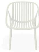
Bini Lounge Armchair Ivory 05384