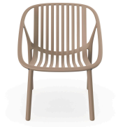
Bini Lounge Armchair Sand 05387