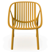
Bini Lounge Armchair Tuscan 05386