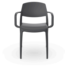
Smart Dark Grey Armchair 05371