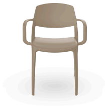
Smart Sand Armchair 05372