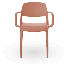
Smart Terra Cotta Armchair 05374