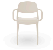
Smart Armchair Ivory 07121