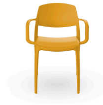
Smart Tuscan Armchair 05375