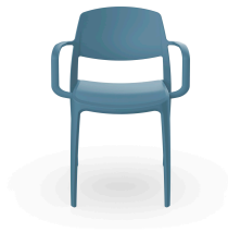
Smart Retro Blue Armchair 05373