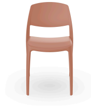
Smart Terra Cotta Chair 05368