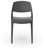
Smart Dark Grey Chair 05365