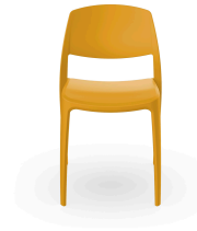
Smart Tuscan Chair 05369