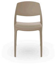
Smart Sand Chair 05366