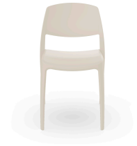
Smart Chair Ivory 07114