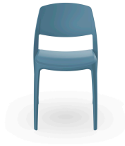
Smart Retro Blue Chair 05367