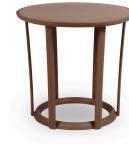
Chocolate Raff Table 04920