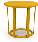
Toscano Raff Table 04919