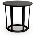
Black Raff Table 04916