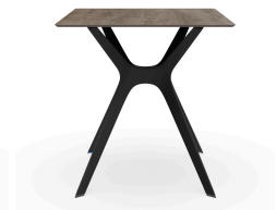
Hpl Ashen Oak Table 70x70 Vela "s" Black Table Foot 04058