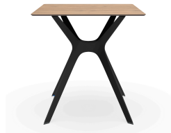
Hpl Natural Oak Table 70x70 Vela "s" Black Table Foot 04059