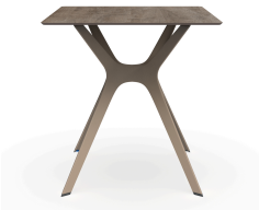
Hpl Ashen Oak Table 70x70 Vela "s" Sand Table Foot 04061