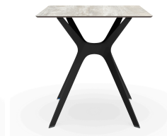
Hpl Washed Wood Table 70x70 Vela "s" Black Table Foot 04057