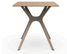
Phenolic Natural Oak Table 70x70 Vela "s" Sand Table Foot 04062