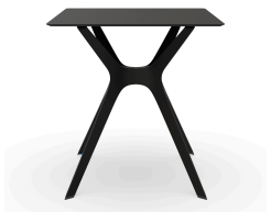
Phenolic Black Table 70x70 Vela "s" Black Table Foot 03059