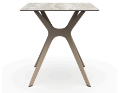
Phenolic Washed Wood Table 70x70 Vela "s" Sand Table Foot 04060