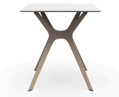
Phenolic White Table 70x70 Vela "s" Sand Table Foot 03061