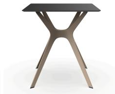
Phenolic Black Table 70x70 Vela "s" Sand Table Foot 03062