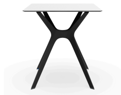
Phenolic White Table 70x70 Black Vela "s" Leg 03058