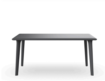
New Dessa 160x90 Table Dark Grey 03946