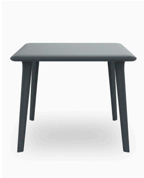
New Dessa 90x90 Table Dark Grey 03944