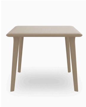
New Dessa 90x90 Table Sand 03945