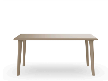
New Dessa 160x90 Table Sand 03947