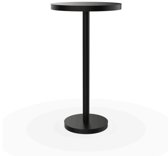
Barcino Black Table Ø60 High Central Leg 01434