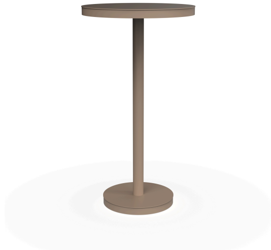
Barcino Sand Table Ø60 High Central Leg 01433