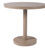
Barcino Sand Table Ø80 Central Leg 01423