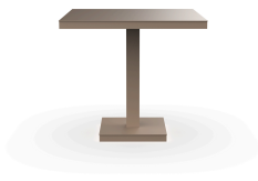
Barcino Sand Table 80x80 Central Leg 01406