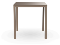
Barcino Sable Table 70x70 01402