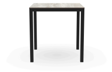
Barcino Compact Washed Wood/Black Table 70x70 04021