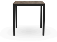
Barcino Compact Ashen Oak/Black Table 70x70 04022