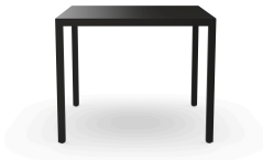
Barcino Black Table 90x90 01401