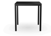
Barcino Compact Black/Black Table 70x70 03031