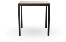
Barcino Compact Natural Oak/Black Table 70x70 04023