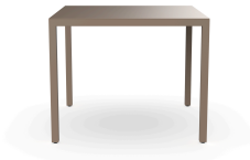
Barcino Sand Table 90x90 01400