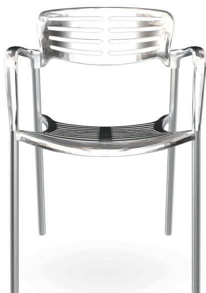
Toledo Armchair 70000