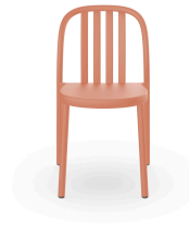
Sue Lama Chair Terra Cotta 05172