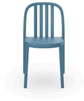
Sue Lama Chair Retro Blue 05170