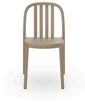
Sue Lama Chair Sand 05169