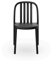
Sue Lama Chair Black 05168