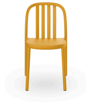
Sue Lama Chair Tuscan 05171