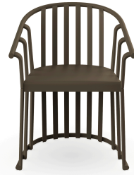
Chocolate Raff Armchair 04913