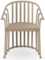
Sand Raff Armchair 04908