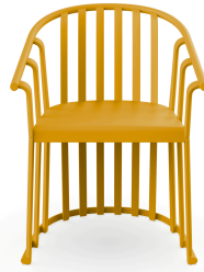
Toscano Raff Armchair 04912