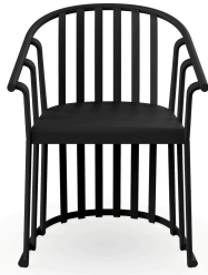
Black Raff Armchair 04909