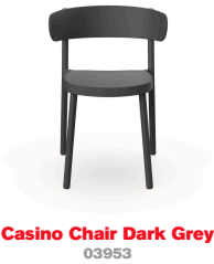
Casino Chair Dark Grey 03953