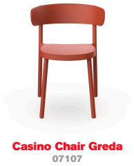
Casino Chair Greda 07107