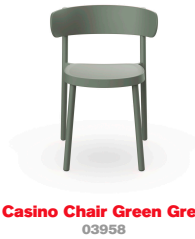
Casino Chair Green Grey 03958