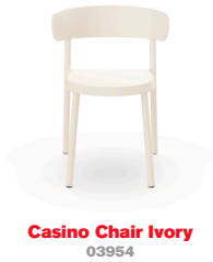
Casino Chair Ivory 03954