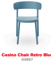
Casino Chair Retro Blue 03957