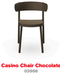
Casino Chair Chocolate 03956