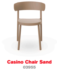
Casino Chair Sand 03955