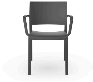
New Fiona Armchair Dark Grey 03541