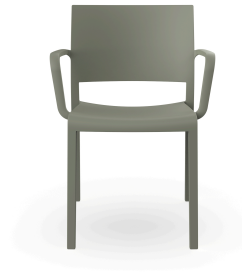
New Fiona Armchair Green Grey 07140