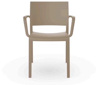
New Fiona Armchair Sand 03540