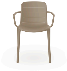
Gina Armchair Sand 03493