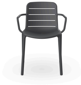
Grey Gina Chair with arms 05261