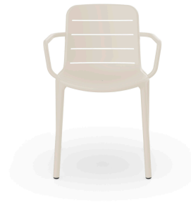
Gina Ivory Armchair 07144