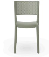
Spot Chair Green-Grey 04599