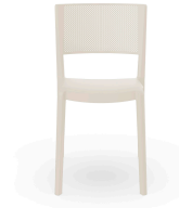
Spot Chair Ivory 07131