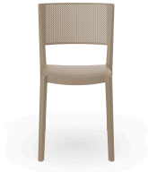
Spot Chair Sand 01653