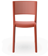
Spot Chair Greda 07132