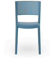
Spot Chair Retro Blue 04600