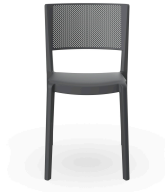
Spot Chair Dark Grey 03960