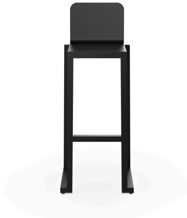
Barcino Black Barstool 01398