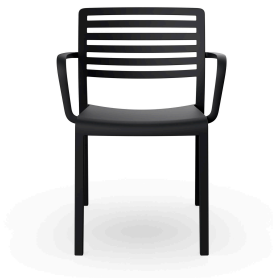
Lama Armchair Black 00873