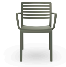
Lama Armchair Green-Grey 07055