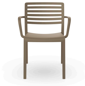
Lama Armchair Sand 01326