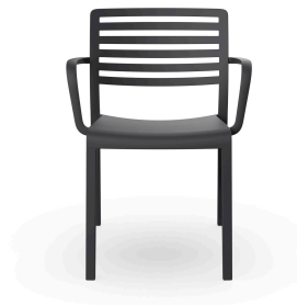
Lama Armchair Dark Grey 01785