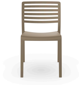
Lama Chair Sand 01336