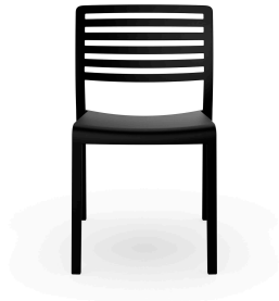
Lama Black Chair 00866