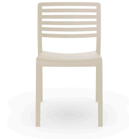
Lama Chair Ivory 07039