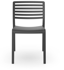
Lama Dark Grey Chair 01784